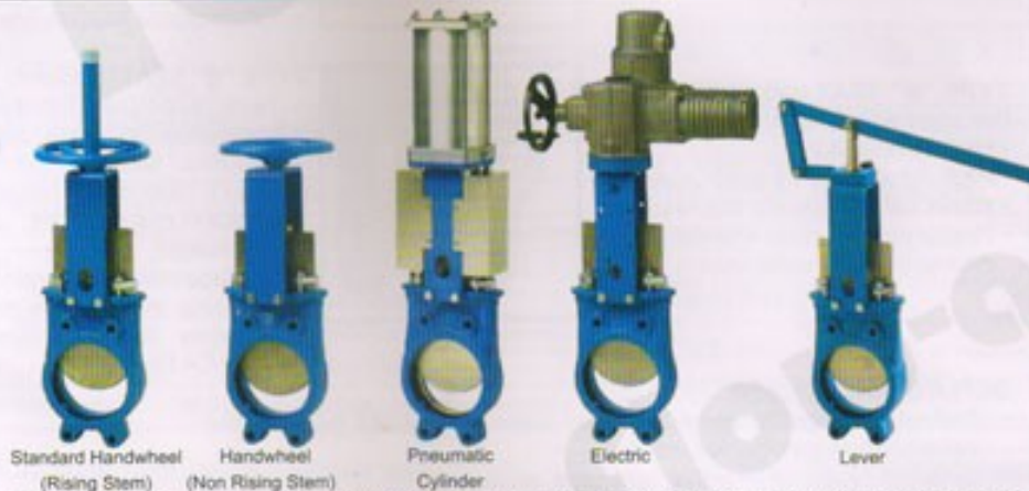
* Please contact us for any type of customized automation in Knife Edge Gate valves for typical applications.

OTHER MFG. RANGE: Pressure Reducing Valve, Safety Relief Valve, Globe Valve, Ball Valve, Gate Valve, Butterfly Valve, Plug Valve, Non Return Valve, Automatic Control Valve, Pneumatic Control Valve, Motorised Control Valve, Diaphragm Valve, Flush Bottom Valve, Strainer, Filter, Pressure Reducing Station, Gas Skid & All type of manual / actuator / cylinder operated valves with any type of automation.